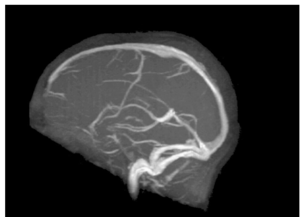
Figure 3. At 6 month's follow-up visit while on oral Dabigatran therapy, repeat MRI of the brain with MRV (right lateral view) revealed patent superior sagittal sinus and right transverse sinus.

Patient was started on Dabigatran 110 mg one tablet per oral twice a day for 6 months, apart from anti-seizure medication and appropriate antibiotics for sinusitis. Full